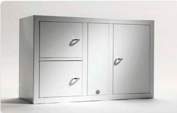
7003 E ValueBox in Expansion series with 3 storage compartments. Exterior dimensions: 745x460x270 mm. Weight: 20 Kg