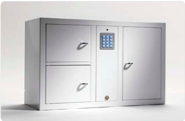
7003 B ValueBox in the Basic series with 3 storage compartments. Exterior dimensions: 745x460x270 mm. Weight: 20 Kg