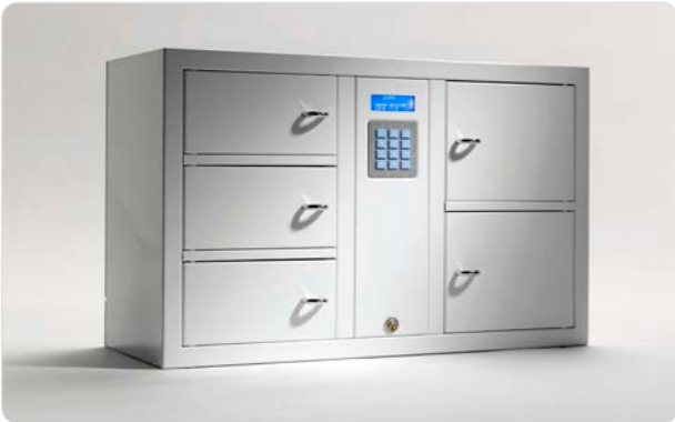
7005 S ValueBox in the System series with 5 storage compartments. Exterior dimensions: 745x460x270 mm. Weight: 20 Kg